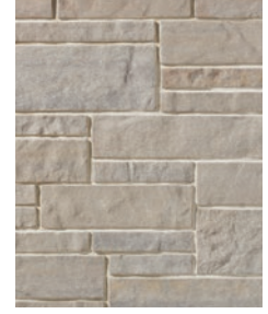
SUNRISE Sizes: Combo, Large Combo