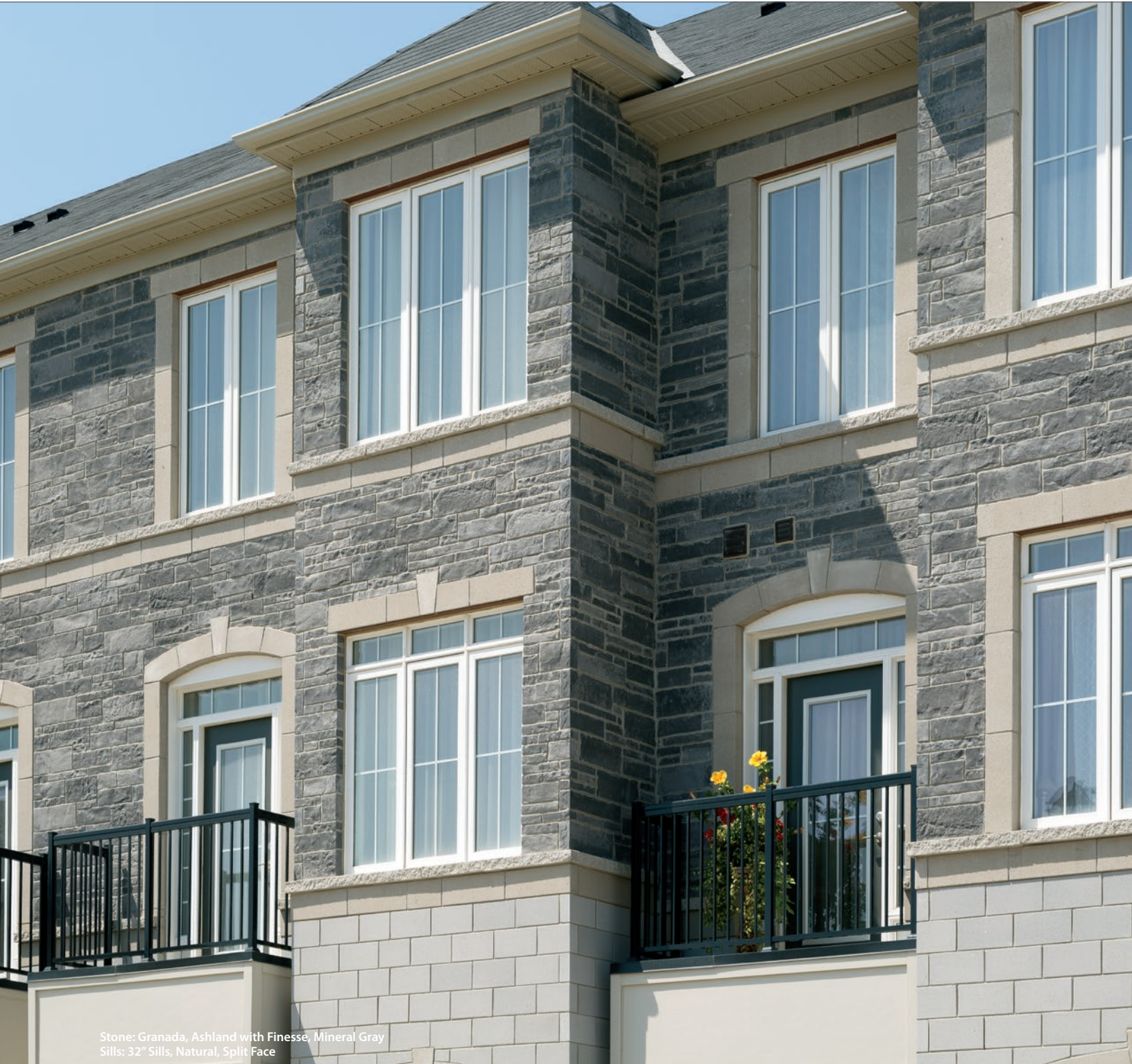
Stone: Granada, Ashland with Finesse, Mineral Gray Sills: 32" Sills, Natural, Split Face

Fresh, marbled colour compositions make Granada an adaptable stone for today's chic design trends. Offered in an array of alluring colours, Granada's unique textures combine easily with our clay and concrete bricks especially well with the sleek, smooth Contempo for unique design options.