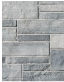
MARBLE GRAY NEW! Sizes: Combo, Large Combo