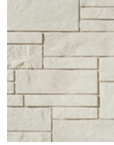
POLAR WHITE Sizes: Combo, Large Combo