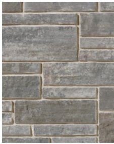
ASHLAND Sizes: Combo, Large Combo

All colours in the sizes shown are Stock Item Products.