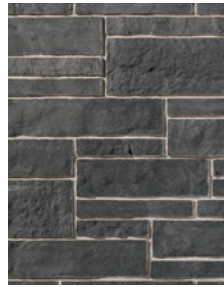
MIDNIGHT Sizes: Combo, Large Combo