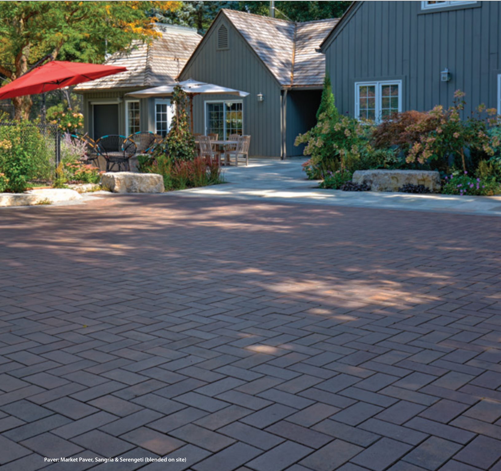
Paver: Market Paver, Sangria & Serengeti (blended on site)

A modern take on heritage, this traditionally-styled 4x8 paver delivers a sophisticated appearance and enduring quality stylishly re-engineered for modern design. The richly-blended tones will endure the elements and significant wear-and-tear as we have incorporated both ColorBold™ and EliteFinish™ technologies into their manufacturing process. At 80mm (3.15") thick, Market Paver is suitable for both vehicular and pedestrian traffic.